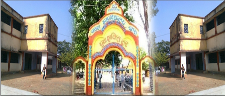
MAIN ENTRANCE GATE OF CHATRA COLLEGE, CHATRA