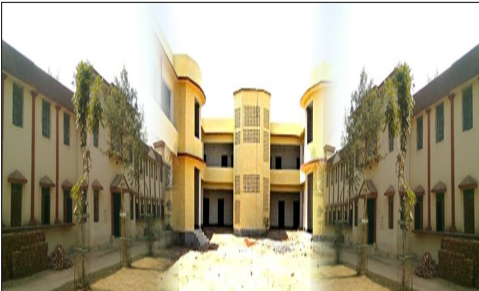
MAIN BUILDING OF CHATRA COLLEGE, CHATRA.